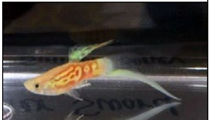
Bunt lower sword blonde guppy.