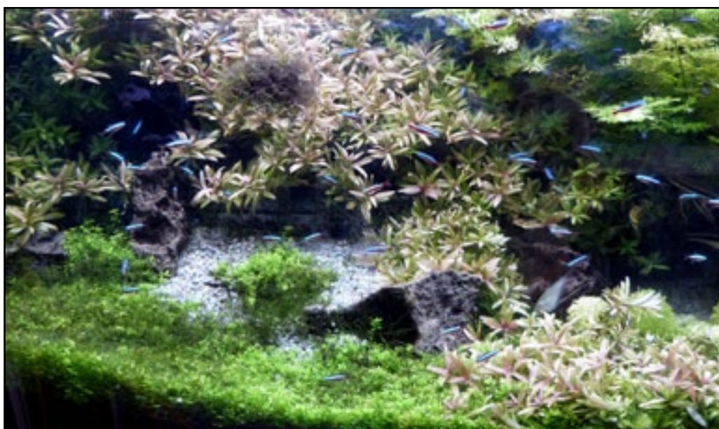
Detail of a display aquarium featuring a large school of cardinal tetras and moonlight gouramis.

So if you are interested in some really great fish with interesting behaviors, some of which may have not ever been bred in captivity, and you want fish that are easy to care for, maybe some of the great variety of minnows, dace and shiners available in the US should be in at least one of your tanks! Give them a try and you may find that you have been overlooking some great fish!!!!