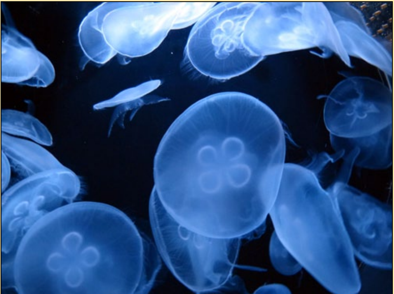
Moon Jellies at Barcelona Aquarium.