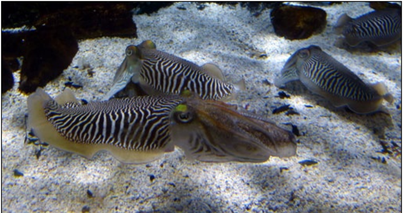
Cuttlefish mating at Barcelona Aquarium.