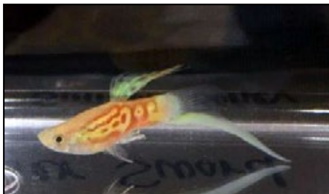
Bunt lower sword blonde guppy.