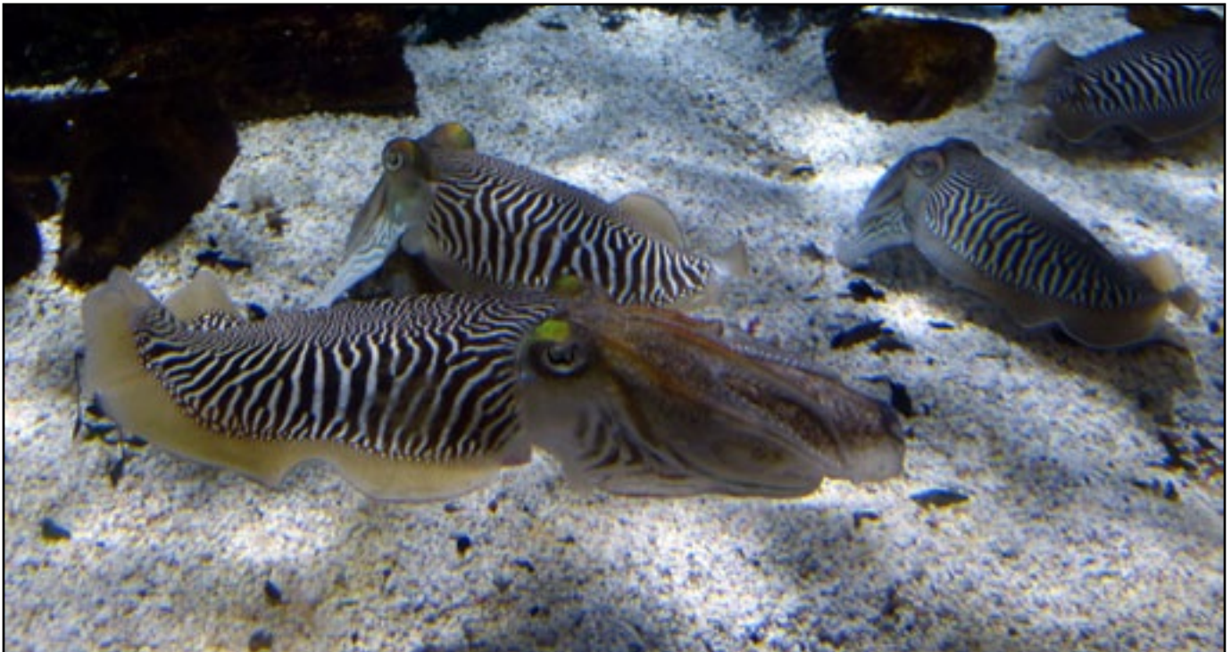
Cuttlefish mating at Barcelona Aquarium.