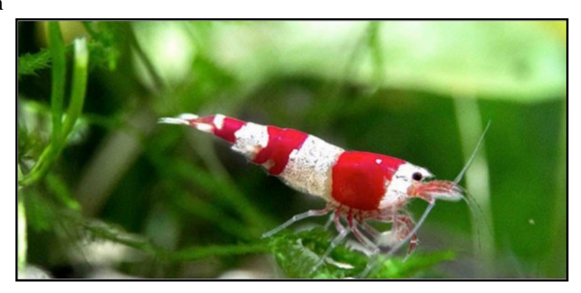
Crystal Red Shrimp.

For a couple of topics that were supposed to be limited to about 10 to 20 minutes each, I believe each one went at least 40 minutes. At the end of the meeting, we had a lot of plants, shrimp and fish to auction off. We barely could finish on time and be out by 9pm, but these "home-grown meetings" are some of the best we have. Judging from the amount of discussion that occurred, others agreed!