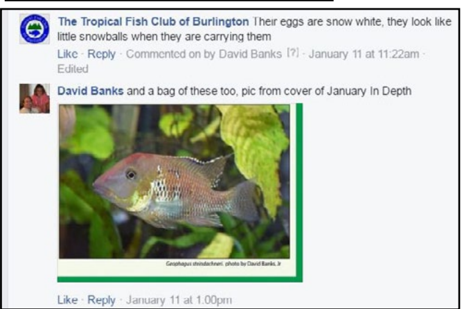
Facebook posts whetted members' appetites for the auction at the end of the meeting.