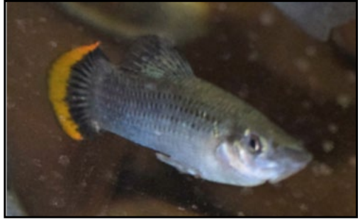
Dominant males (upper photo) are more colorful than less dominant males (lower).

orange markings on his tail! So I looked closer and discovered that I had at least 5 males out of the ten now-adult-sized mollies. Each clearly showed a gonopodium and, over the next few weeks, the color came out on all of them. Not sure if this was a case of changing sex, or slow sexual development, or me just not examining them closely enough. They were happily living with many fish including a breeding pair of the mid-sized and fairly peaceful Cryptoheros nanoluteus , a Central American cichlid. All the males have been showing that great color pattern ever since I first noticed it, so I can't image I never noticed it previously.