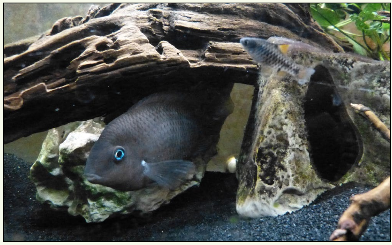
A medium-sized Central American cichlid, Cryptoheros chetumalensis , male.