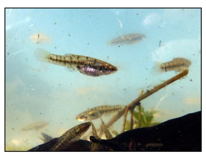
The Least Killifish ( Heterandria formosa ) is a native livebearer that benefits from a heavily planted tank and high quality food.

Another strategy is to have so much vegetation in the tank that it really limits the mother's ability to find the fry after delivery. A tank full of hornwort, cambomba, elodea or other dense submerged plant will work, just leave a small open area for the female in the center of the tank. Once she slims down, you can remove her,