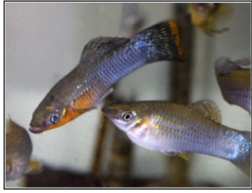
Pair of Mexican Mollies, male on left.

The fry all grew nicely, but I didn't see any males, only females which are basically a nice silver/gray color throughout. After almost a year, I had all but given up on them and moved them to a 40-gallon tank of miscellaneous fish. One day I noticed a flash of color swim by—it was a Mexicana male with his nice black and