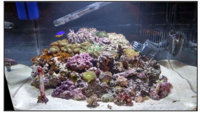
Live rock, coral and anemones in a nano tank.